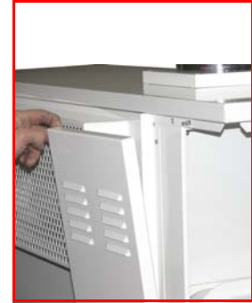
Fixing of the panels by inserts in order to facilitate the access and to avoid any external screws and bolts