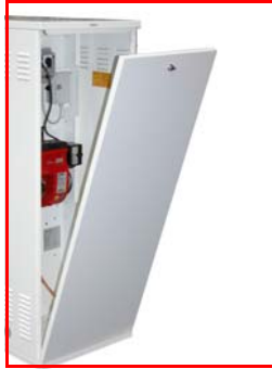
Front access door for burner, electrical equipment, room thermostat and oil filter