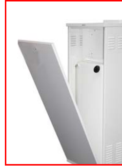
Back access door for oil integrated tank with gauge