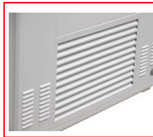
Air external inlet anti-rain grid . Can be fitted on left or right side of the heater.