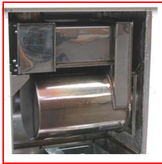
Stainless steel combustion chamber with high efficiency heat exchanger