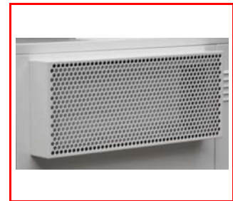
Warm air output grid with automatic non-return valve . Can be fitted on left or right side of the heater.