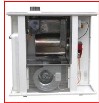
Quick accessibility with all the components for an easy maintenance (5 to 10 minutes to reach the fan and the combustion chamber)