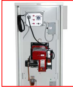
Combustion and electrical compartment