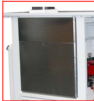
Double steel plate for thermo-acoustic insulation and to maintain the panels external cold, thus removing any risk of burns