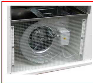
High pressure centrifugal fan silencers - IP55 Equipped with grid